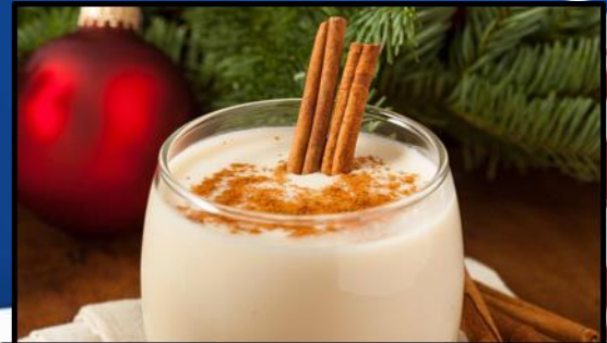
Egg Nog – a drink made of cream, milk, sugar and beaten eggs.