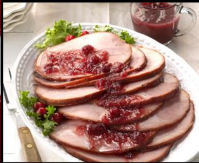
Ham with cranberry sauce