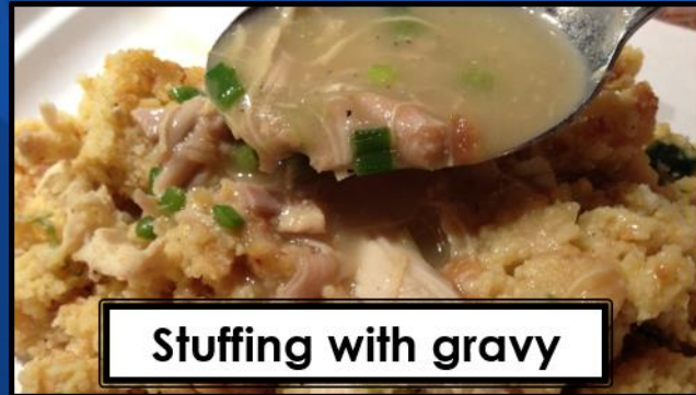
Stuffing with gravy